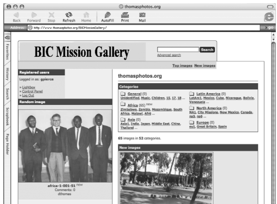
This screen shot shows the current "Africa" page with two of the initial sixty-five thumbnails of images from Zimbabwe. A registered user will be able to click on a photo to access another page giving what detail is known about that photo, with a text box where additional comments may be submitted.